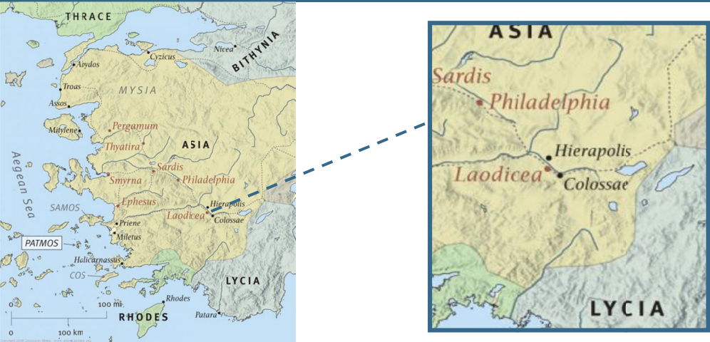
Maps sourced from ESV Study Bible , (Wheaton, IL: Crossway, 2008)